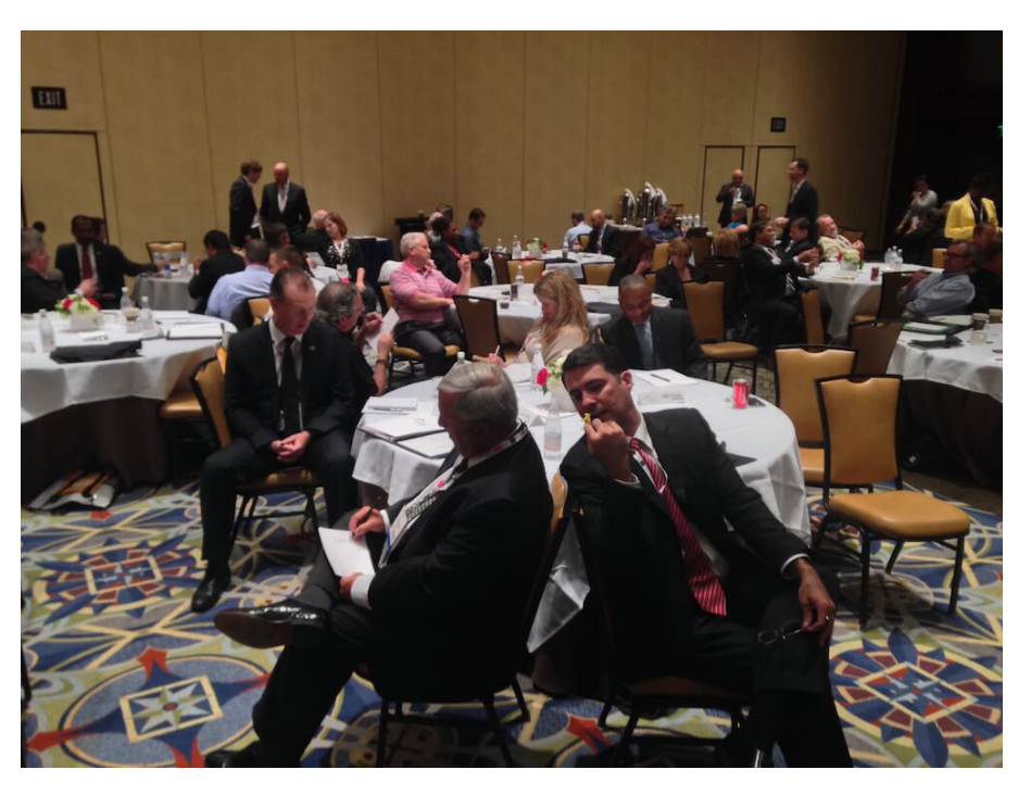
Figure 10: Executives participate in a drawing exercise as a part of the Campbell Institute executive summit.

The success of these early workshops has led to the expansion of the program in an effort to operationalize visual literacy by integrating it into existing safety training and certification programs. Additionally, as a result of our work locally, TMA was invited in the fall of 2015 to present a visual literacy workshop at the Campbell Institute during the National Safety Council's annual conference. During this three-hour workshop, TMA facilitators led over 125 EHS leaders from the nation's largest employers in visual literacy exercises. During the discussion at the end of the session, these health and safety leaders returned repeatedly to the value of visual literacy for illuminating hidden visual biases and vulnerabilities, that is, the ways that visual literacy can make the unseen, seen.