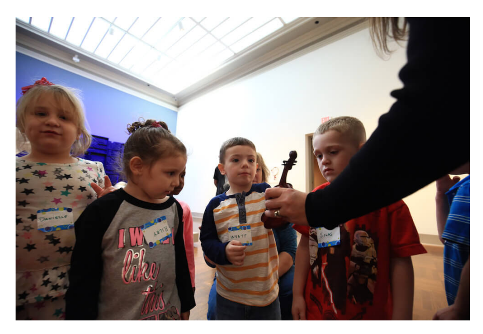
Figure 6: Preschool tour participants handle an object from the Teaching Collection during a gallery experience.

From September through December 2014, TPS and TMA collaborated on a pilot study to measure educational outcomes associated with preschool tours. The study was conducted jointly by TPS teachers and occupational therapists as well as TMA educators and docents, and included eight classes of students from Mayfair Preschool aged between three and five at the beginning of the trial. The purpose of the study was to assess the extent to which pre-literacy skills were enhanced by exposure to visual literacy curricula. Pre-literacy skills were measured by the acquisition of new words. Specifically, tier two vocabulary—that is, words to which the students were unlikely to have been exposed—were introduced through the visual literacy curriculum. Follow-up assessments measured how many of those words were used.