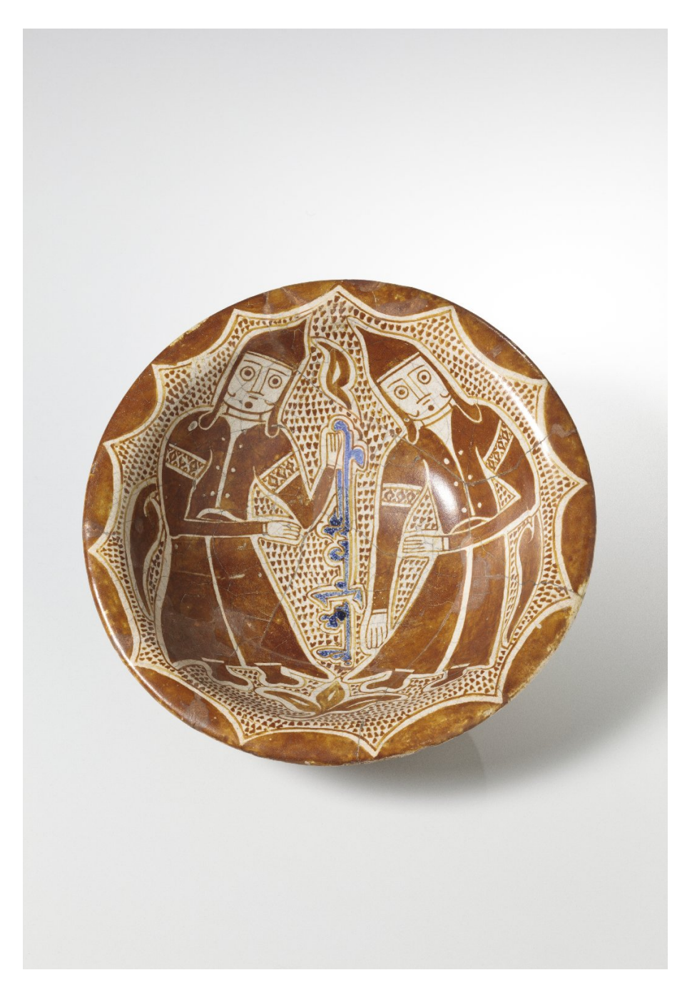
Figure 9: Abbasid, Iraq (possibly Baghdad), Bowl, early 10th century. Samarra ware, earthenware with gold luster and blue over glaze, Diam. 8 1/2 in. (21.6 cm). Toledo Museum of Art (Toledo, Ohio). Purchased with funds from the Libbey Endowment, Gift of Edward Drummond Libbey, 1941.23.

Activities for these workshops are selected from the visual literacy curriculum for their ability to help participants recognize the existence and effect of visual bias. One particularly effective exercise for illustrating the ways in which the same image can be seen very differently is called back-to-back drawing. In this exercise, participants are paired up into describing and drawing roles. 'Drawers' must recreate a work of art that they cannot see based on the verbal descriptions provided by their partners. During one workshop, a 'describer' working with a 10^{th} century Islamic platter gave information about a pattern of upside-down 'u's on the lip of the vessel