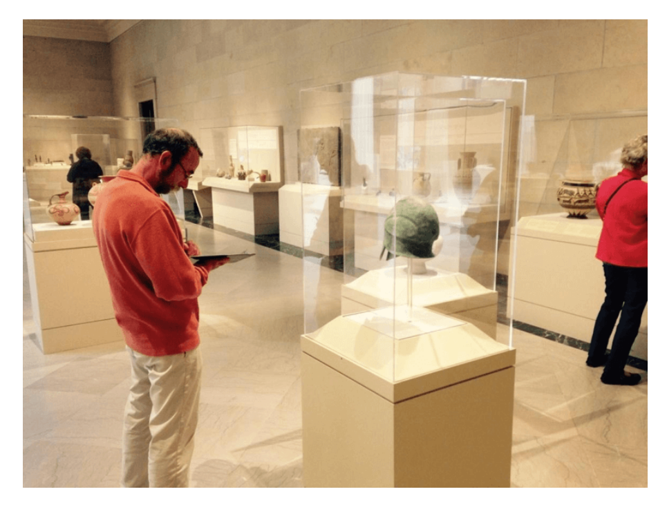
Figure 4: TMA staff member engaged in a drawing exercise as part of a staff professional development workshop.

Currently we are in the process of institutionalizing the professional development curriculum itself. Beginning in 2016 the workshop will become an integrated component of the new staff orientation process. An early outcome of these efforts has been the development of an initiative between facilities, security, education, and the director's office to use visual literacy practices to enhance museum safety and security.