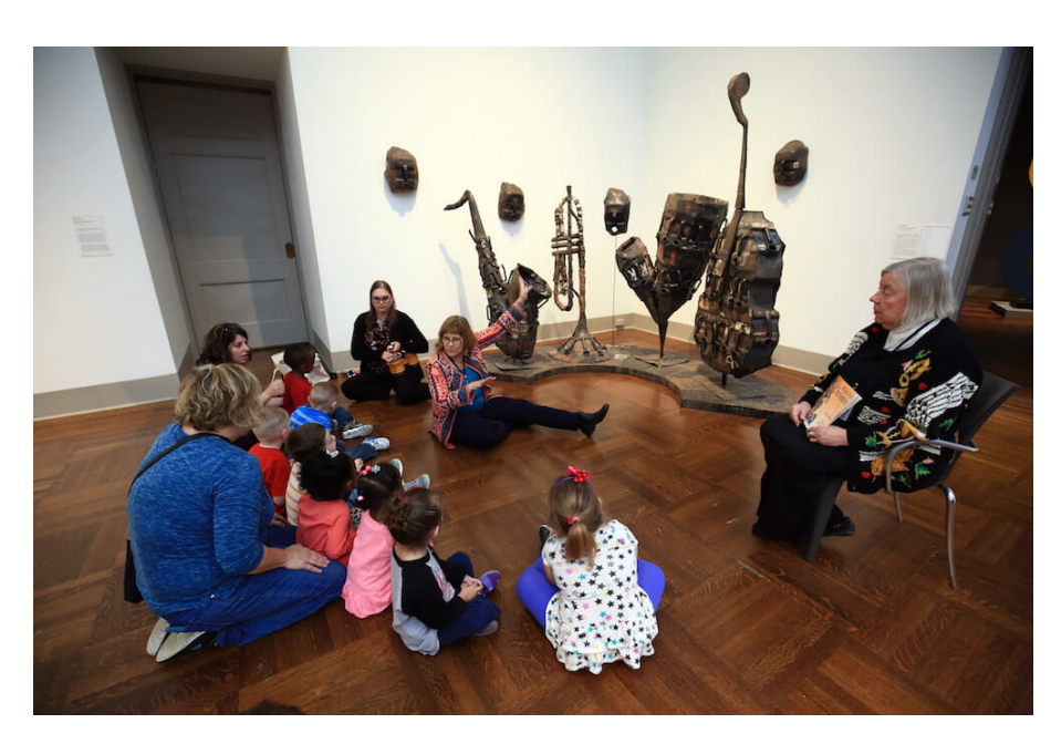
Figure 5: Preschool tour participants in front of Made in Porto Novo by Romuald Hazoume.

As discussed earlier, the visual literacy curriculum utilizes a scaffolded approach, which enables us to modify and adapt the curriculum as appropriate for the audience; only the components of the curriculum that are developmentally appropriate are employed in the program. For example, programs for our youngest visitors focus on supporting the development of descriptive vocabulary by teaching the Elements of Art. Preschool tours are such programs. These tours support classroom preliteracy skills development through hands-on gallery experiences. The kinds of experiences used in these tours range from drawing to tactile and kinesthetic experiences. During the preschool tour that explores Made in Porto Novo by Romuald Hazoume students listen to a sample of saxophone music, pantomime play an instrument, tap out a percussion pattern on the floor, and feel a sample of textured metal (Figure 5 and 6). These multimodal experiences are used as opportunities to reinforce targeted descriptive vocabulary.