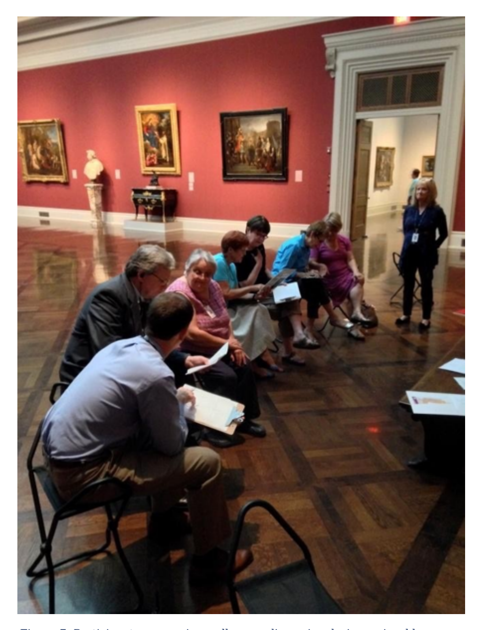
Figure 7: Participants engage in small group discussion during a visual language workshop.

Visual literacy is implicitly incorporated into the public programs and permanent galleries and special exhibitions enjoyed by TMA's 400,000+ annual visitors. In addition to these efforts, the museum has developed both programmatic and self-guided opportunities for interested visitors to explicitly engage with visual literacy in the museum.