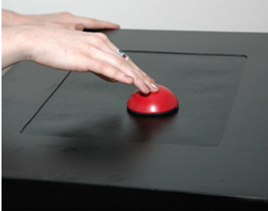
Figure 1. HyperGlyphs Installation. A special mouse, with a spherical shape, mirrors the shape and color of three-dimensional spheres the participants move in the interactive programs.

Contemporary scientists demonstrated that scientific data consists of dynamic, multidimensional relationships that are defined by context and how the context changes over space and time (Search, 2014). Beyond Time integrates forms, words, and sounds, inspired by indigenous cultures, with visualizations of scientific data.